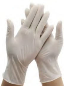
gloves multipurpose latex ( non powdered )