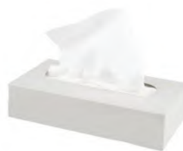
Tissue Facial - box