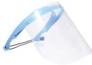
Face Protector shield - removable visor