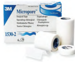
Microporous Surgical Tapes