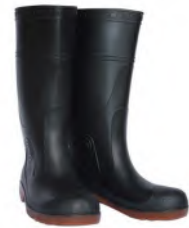
Sterile Rubber Boots