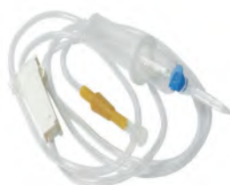
Infusion Set, with Air Inlet - 21G