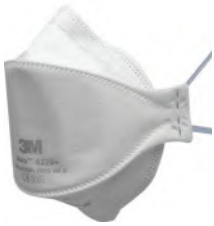
3M Aura 9320