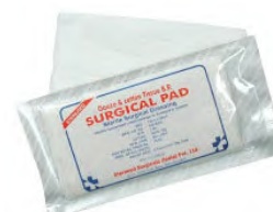
Surgical Pad Gauze & Cotton tissue