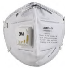
Respirator Face Mask