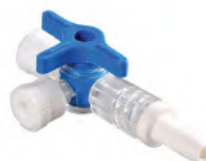
3 Way Stop Cock