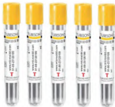
Collection Tubes Vacuum