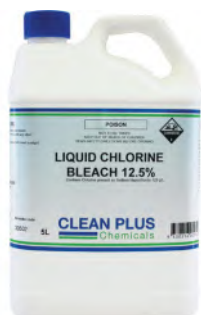
Bleach, Liquid, 5L