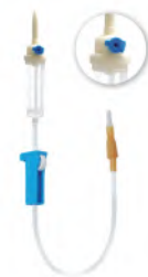
Infusion Set with Air Vent