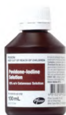
Povidone-Iodine, 10%, 100ml