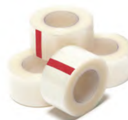
Transparent Perforated Plastic Film Tape