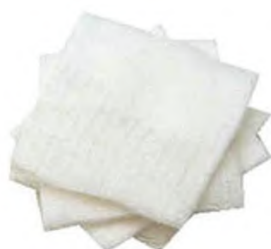
Sterile Absorbent Gauze Swab