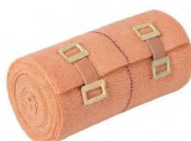
Kay Crepe Bandages