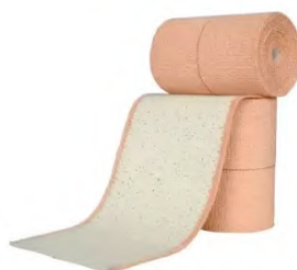
Elastic Adhesive Bandage BP