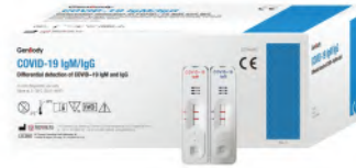
Rapid Test Kits