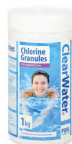
Water Purification, NaDCC, Granule, w/spoon, 1kg