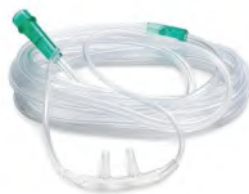
Nasal Oxygen Cannula