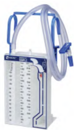
Chest Drainage System