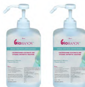
Soap, Hand, Liquid, W/Pump, 500ml