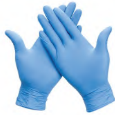
Examination Gloves Nitrite ( non powdered )