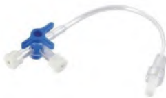
3 Way Stop Cock with Extension Line