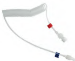
PE Pressure Monitoring Line Spiral