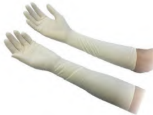
Fore Arm non powdered