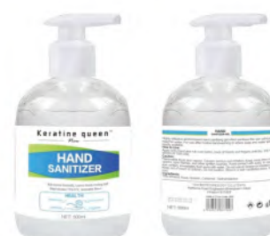
Hand Sanitizer, Gel, 500ml