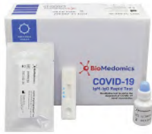
Covid Test Kits