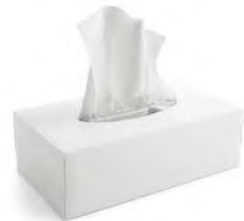
Tissue - Facial Box