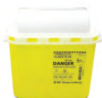
Sharps Collector, carton, 5L