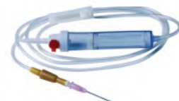
Blood Transfusion Set