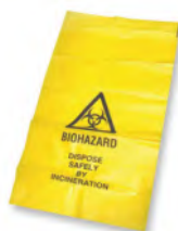
Biohazard Specimen Bag, yellow, 90X70cm