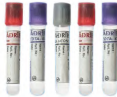
Collection Tubes Non Vacuum