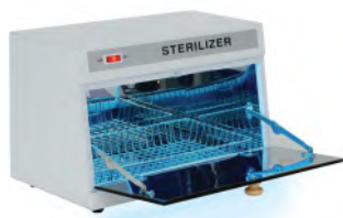
UV Sanitation Cabinet