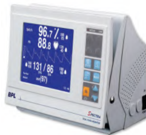
Heart Rate Monitor