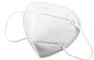
N95 Face Mask