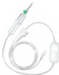
Infusion Set with Filter