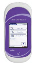
Blood Sugar Monitor