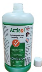
Disinfectant, Liquid, 1L